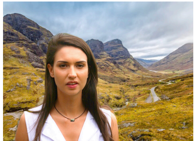
Glencoe Necklace Small - £11